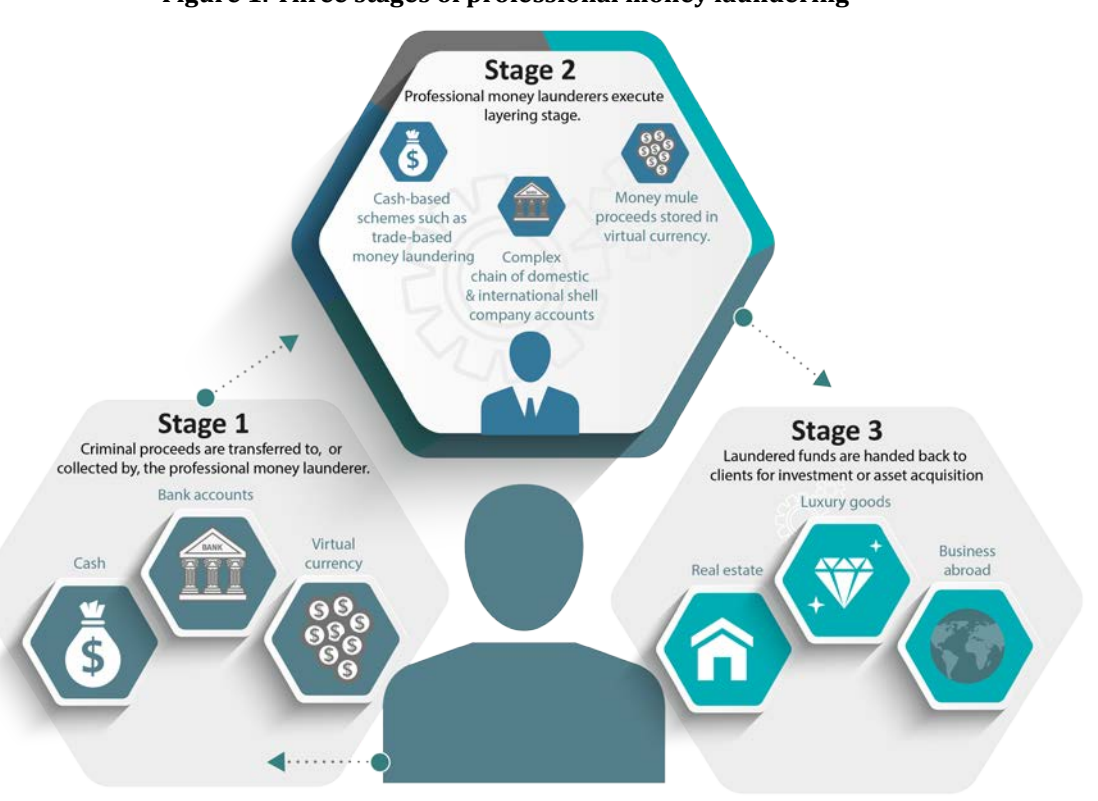
Figure 1. Three stages of professional money laundering