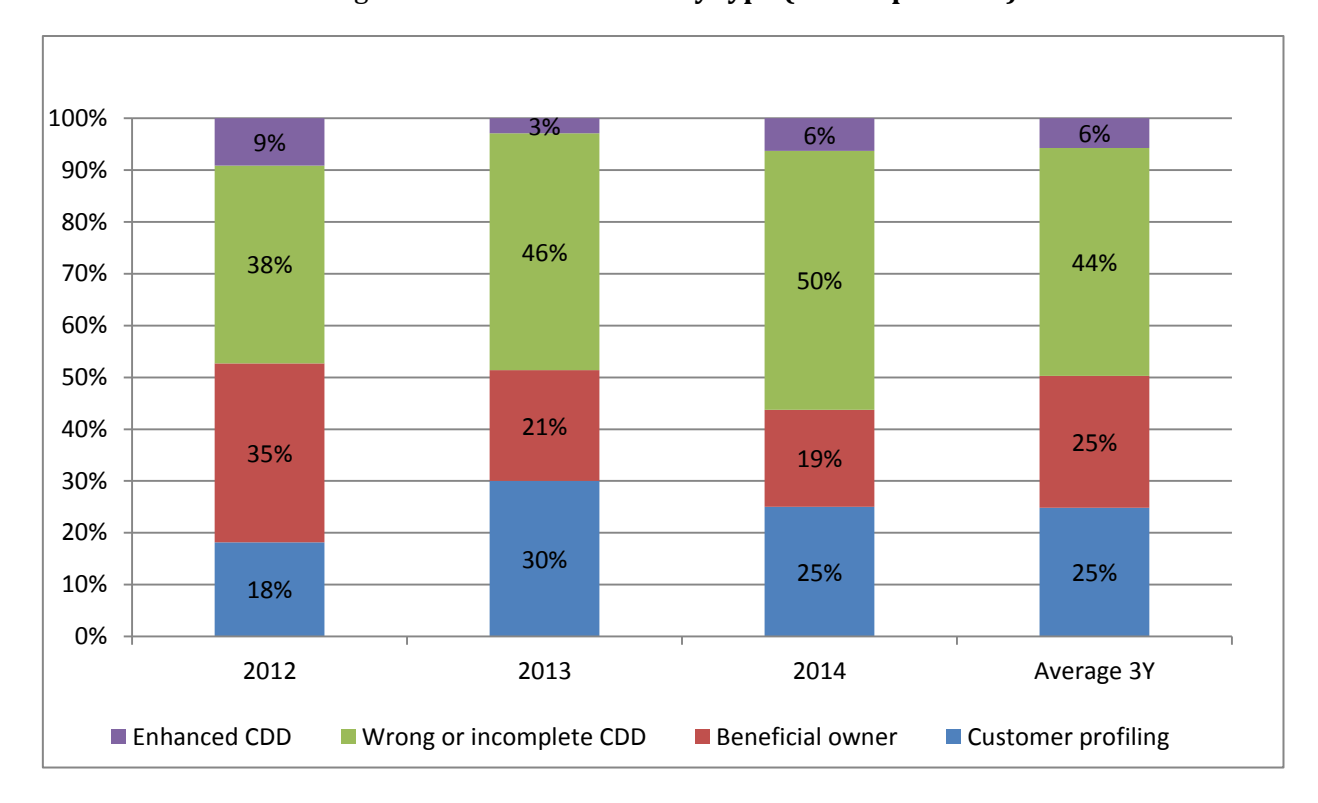
Figure 3. CDD deficiencies by type (BOI inspections)

253. However, these data should be treated with some care, as the recorded deficiencies relate to both isolated failures within an institution, and failures that have more systemic implications for an institution. Therefore, it is not possible to draw any firm conclusions about the true depth of the weaknesses, although the regulators were of the opinion that the overall quality of the banks' CDD procedures has been improving in the last two years. A particular challenge has been in trying to complete the CDD procedures for clients that were on the books prior to the introduction of the AML Law. The BoI estimates that about 90% of these have now been successfully processed.